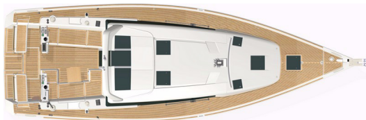
2 cabins - 1 Head version